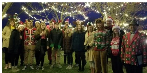
Blue Notes at Christmas in the Village

Blue Notes is an advanced musical ensemble that gives students enrolled in choir the opportunity to create music at the "next level." Additionally, the Blue Notes perform at all choir concerts, Blues in the Night, re:Voiced, the Snow Tour (December), Capitol Pageant, Solo & Ensemble, and more! Because the Blue Notes are such a versatile group of singers, they sing a huge variety of music throughout the year including contemporary pop a cappella, vocal jazz, madrigals, and chamber music. Students earn a 1/2 credit for their participation in this club.