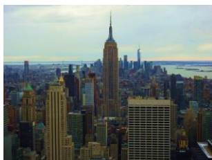
New York City 2018