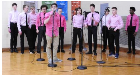
Kittens Mittens at Bowls for Hunger