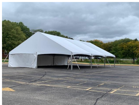
WYSO practice area in MHS front lot

WYSO season began in September with woodwind and brass ensembles rehearsing outdoors at McFarland High School in tents. Musicians are spaced at least 6 feet apart from one another, wear face coverings, and also use special coverings for their instruments. In October WYSO will begin transitioning to indoor activities for string and percussion students using the same health and safety protocols. This transition coincides with McFarland School District's transition to in-person instruction for all students grades K-2, in-person educational supports for students in grades 3-12, and the beginning of indoor co-curricular and community recreation activities under PHMDC Youth Settings and Mass Gatherings rules. Eventually, when public health conditions permit, both WYSO and McFarland School District will resume traditional programming and our students and staff will be able to collaborate in-person artistically and educationally. For now, we are all moving forward to create the best educational opportunities we can with the health and safety of students and staff as our highest priority.