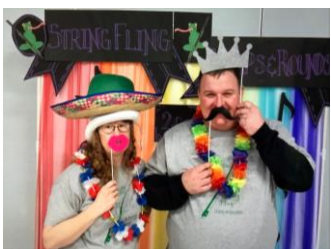
String Fling 2020