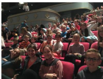
Link Up Program Field Trip. The students sang, played recorders, and listened attentively to the Madison Symphony Orchestra perform.